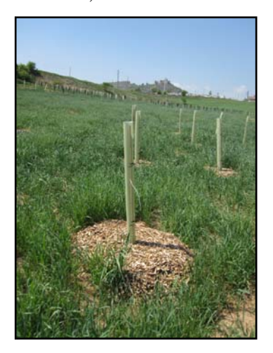
Field trial at year 1