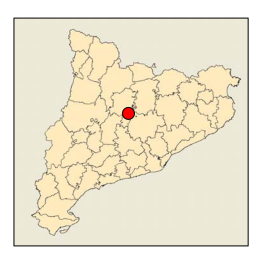
Field trial location in Catalonia